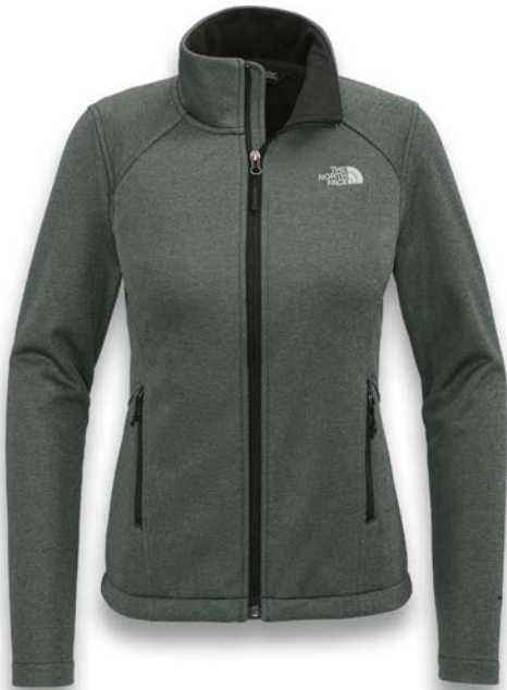
new The North Face® Ladies Chest Logo Ridgewall Soft Shell Jacket NFOA88D4 | Ladies Sizes: S-2XL | 3 colors