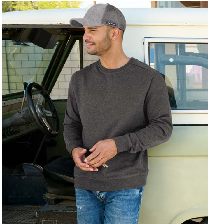
District® Re-Fleece™ Crew DT8104 | Adult Sizes: XS-4XL | 4 colors