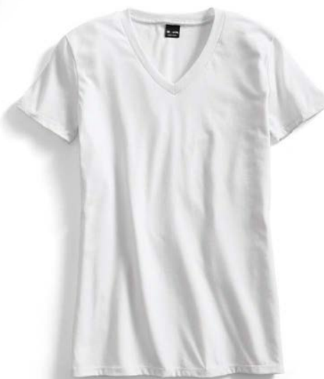
FREE Allmade® Women's Tri-Blend V-Neck Tee AL2018 Women's Sizes: XS-2XL 17 colors