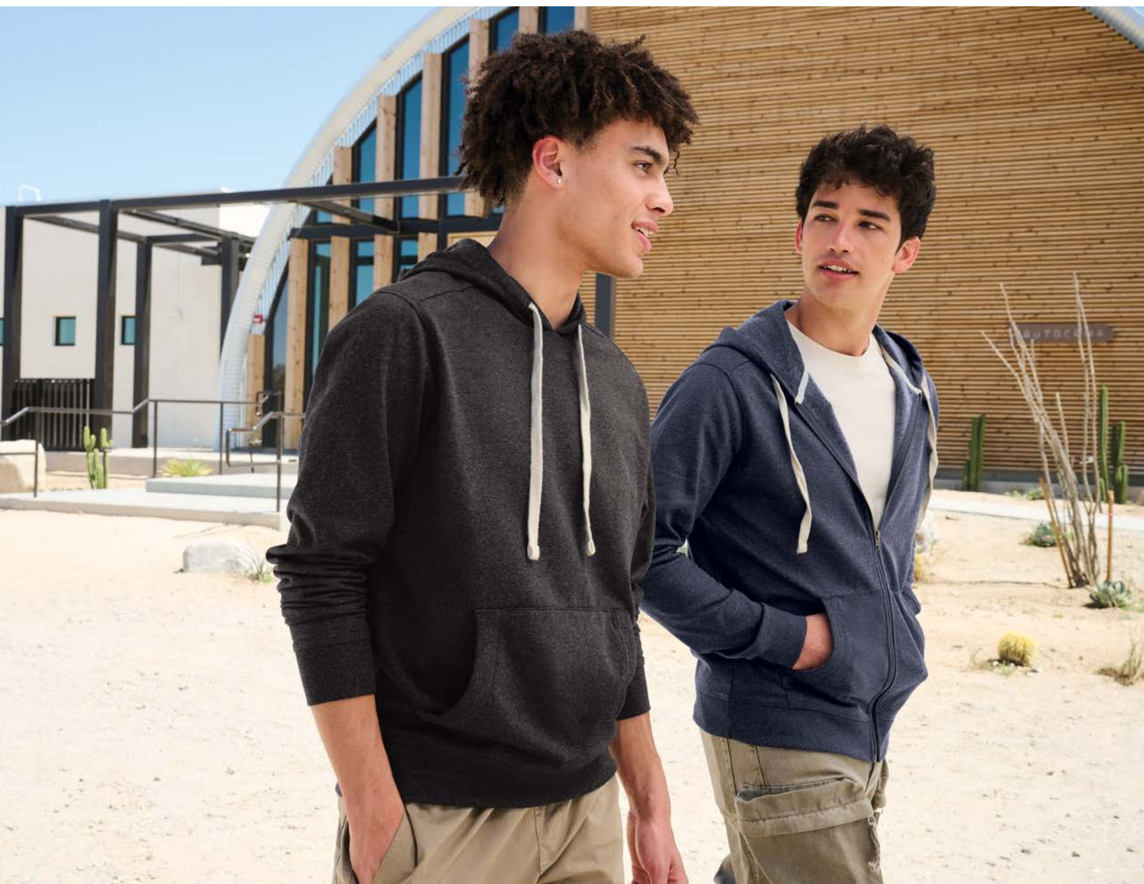
District® Re-Fleece™ Hoodie DT8100 | Adult Sizes: XS-4XL | 7 colors