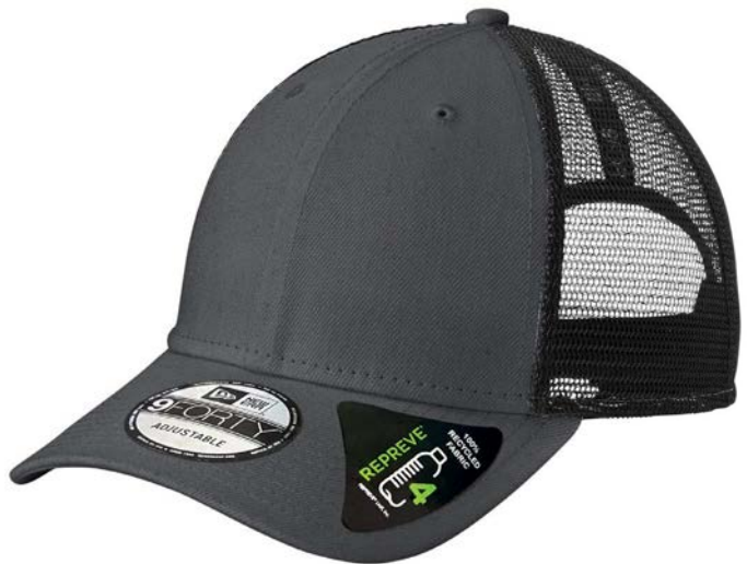
New Era® Recycled Snapback Cap NE208 | 5 colors