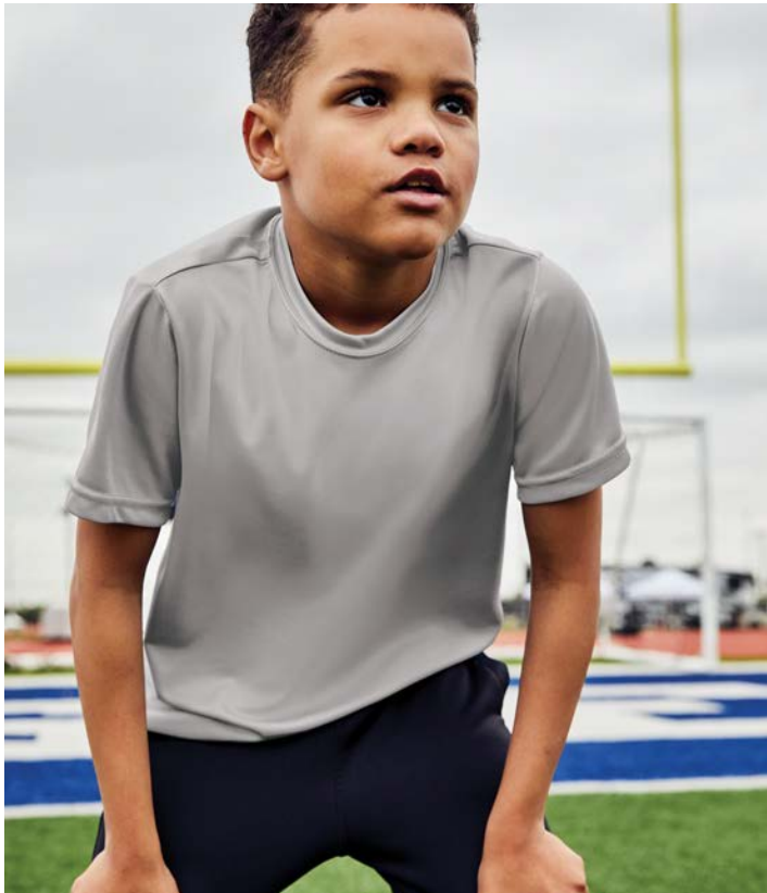
FREE Sport-Tek® Youth PosiCharge® Re-Compete Tee YST720 | Youth Sizes: XS-XL | 9 colors