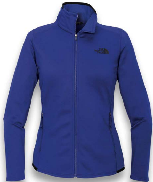
The North Face® Ladies Skyline Full-Zip Fleece Jacket NF0A7V62 | Ladies Sizes: S-2XL | 5 colors