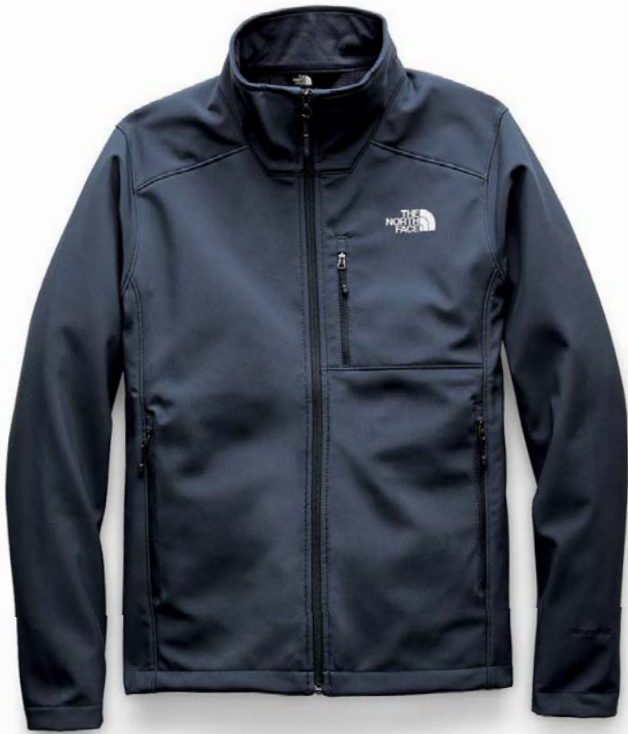
The North Face® Apex Barrier Soft Shell Jacket NFOA3LGT Adult Sizes: S-3XL 4 colors