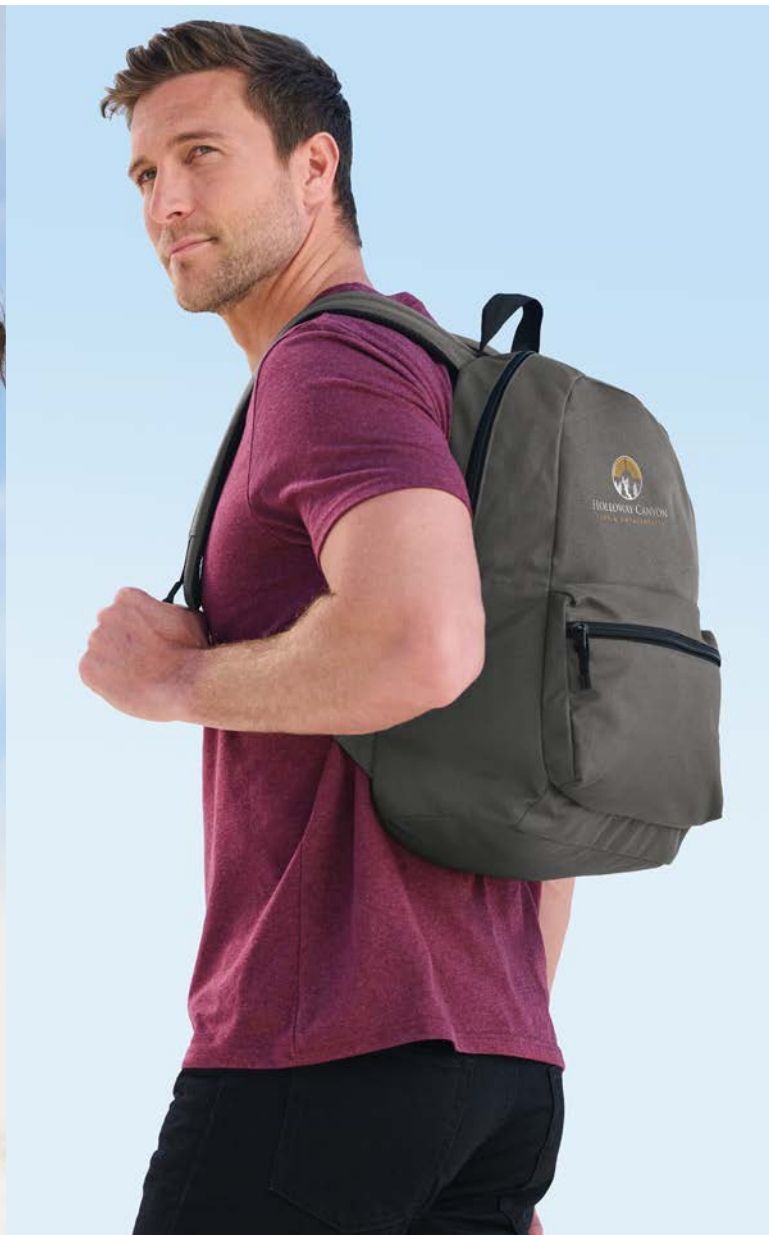
FREE Port Authority® C-FREE® Recycled Backpack BG270 | 3 colors