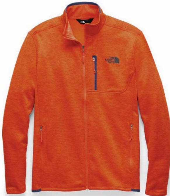
The North Face® Skyline Full-Zip Fleece Jacket NF0A7V64 | Adult Sizes: S-3XL | 5 colors