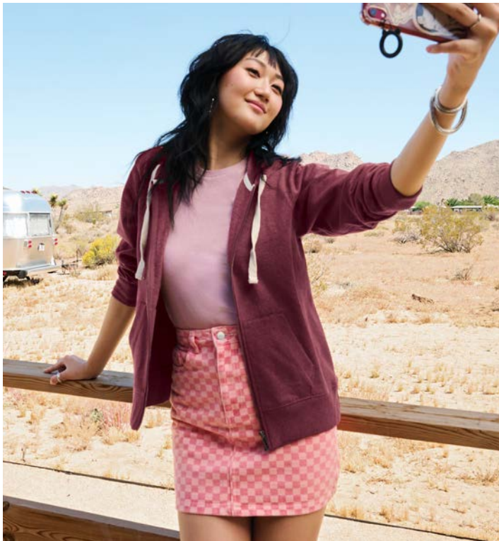
District® Women's Re-Fleece™ Full-Zip Hoodie DT8103 | Women's Sizes: XS-4XL | 5 colors