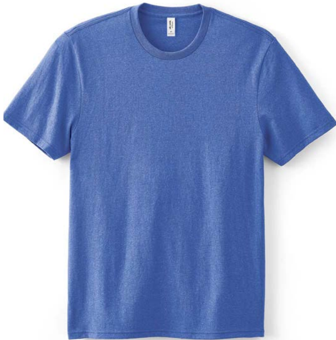
FREE Allmade® Unisex Recycled Blend Tee AL2300 | Unisex Sizes: XS-4XL | 5 Colors

Made with reclaimed cotton scraps and recycled polyester.