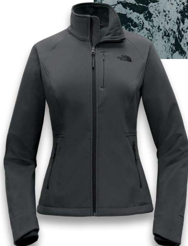
The North Face® Ladies Apex Barrier Soft Shell Jacket NFOA3LGU Ladies Sizes: S-2XL 3 colors