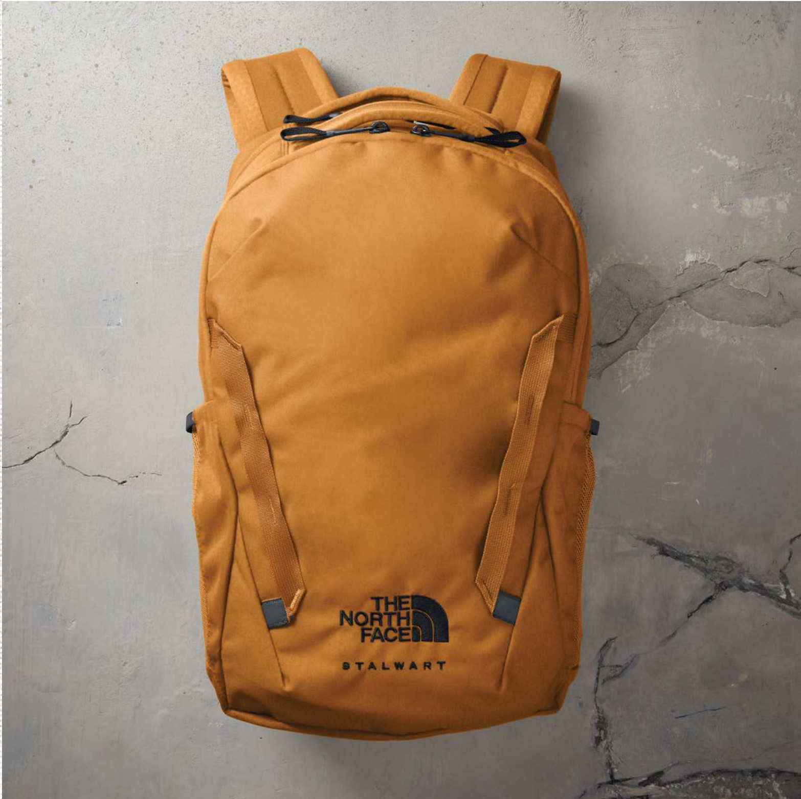
The North Face® Stalwart Backpack NF0A52S6 | 4 colors