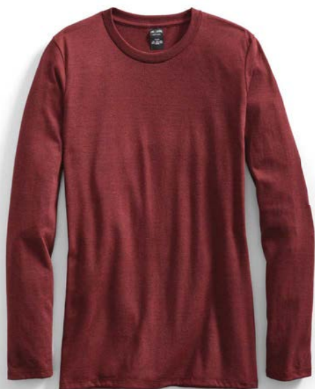
FREE Allmade® Women's Tri-Blend Long Sleeve Tee AL6008 | Women's Sizes: XS-2XL | 9 colors