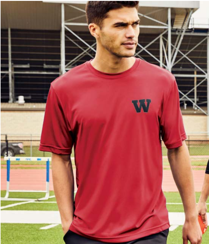
FREE Sport-Tek® PosiCharge® Re-Compete Tee ST720 | Adult Sizes: XS-4XL | 9 colors