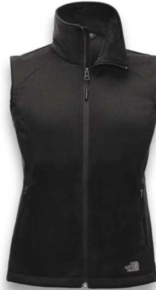
The North Face® Ladies Ridgewall Soft Shell Vest NFOA3LH1 Ladies Sizes: S-2XL | 2 colors