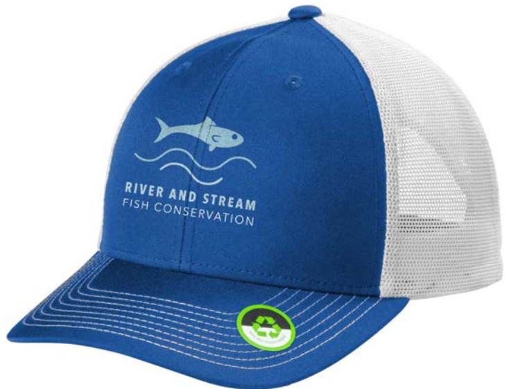
Port Authority® Eco Snapback Trucker Cap C112ECO | 5 colors