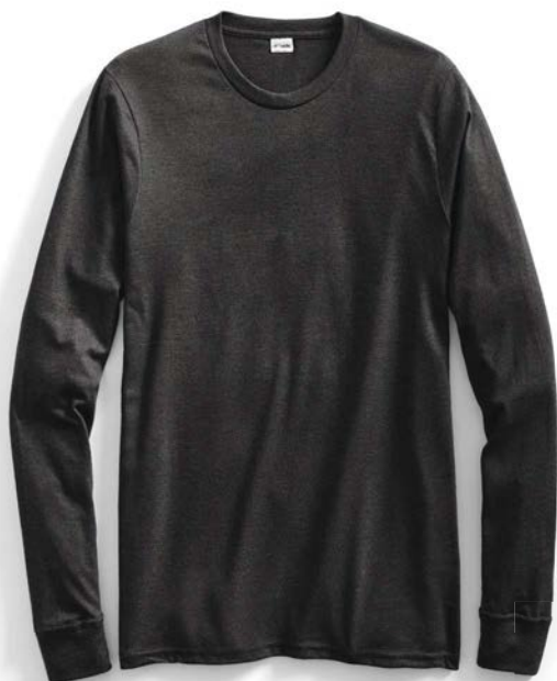
FREE Allmade® Unisex Tri-Blend Long Sleeve Tee AL6004 Unisex Sizes: XS-4XL 13 colors

Made with a sustainable blend of recycled polyester, organic cotton and modal.