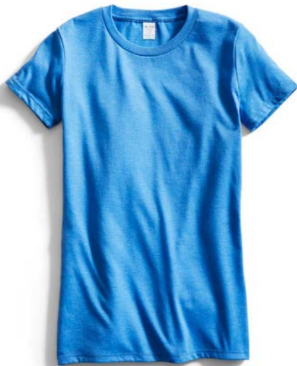
FREE Allmade® Youth Tri-Blend Tee AL207 | Youth Sizes: XS-XL | 10 colors