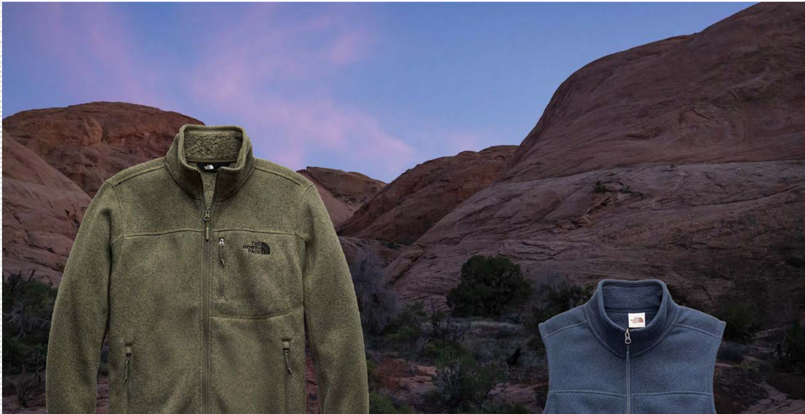
The North Face® Sweater Fleece Jacket NFOA3LH7 Adult Sizes: S-3XL 4 colors