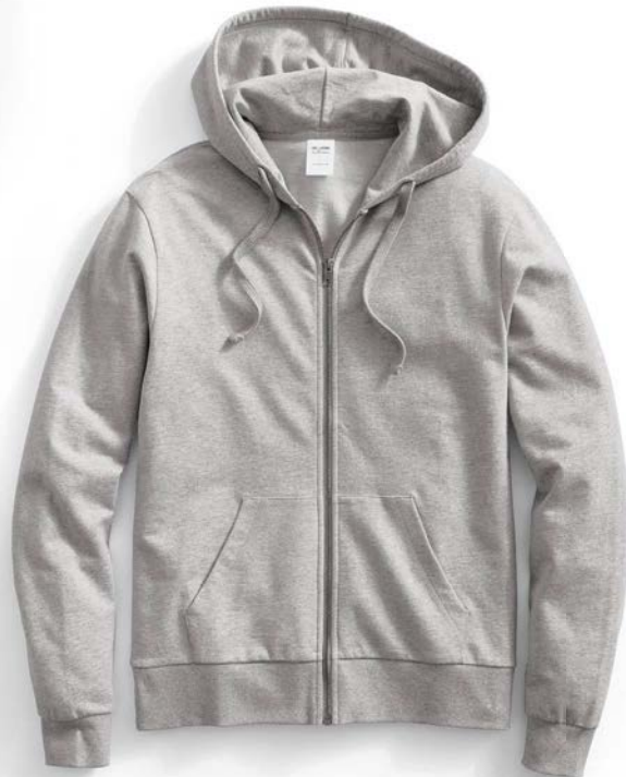
FREE Allmade® Unisex Organic French Terry Full-Zip Hoodie AL4002 | Unisex Sizes: XS-4XL | 4 colors