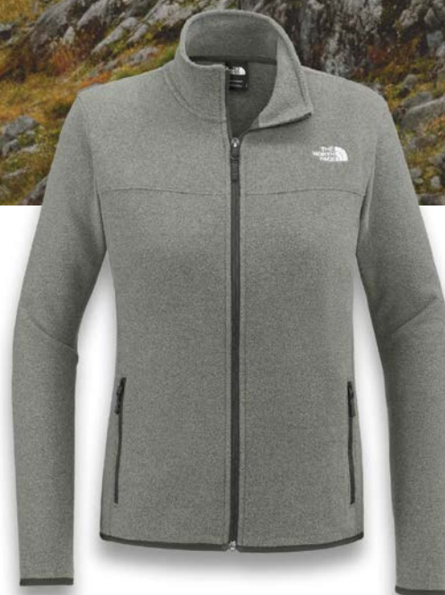
new The North Face® Ladies Glacier Full-Zip Fleece Jacket NF0A7V4K | Ladies Sizes: S-2XL | 5 colors