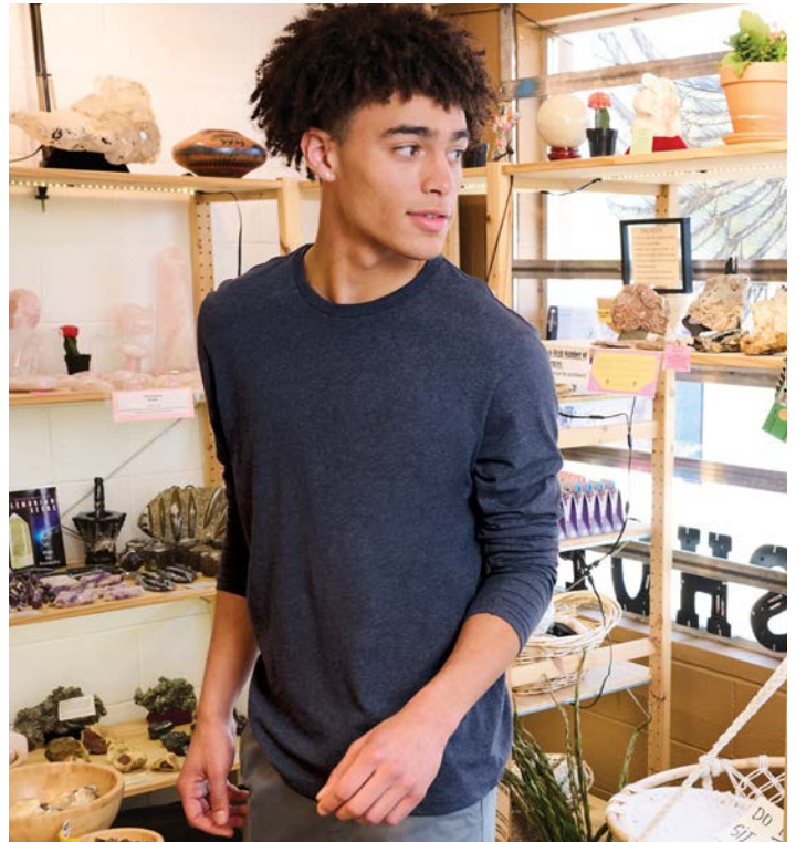
FREE District® Re-Tee® Long Sleeve DT8003 | Adult Sizes: XS-4XL | 5 colors