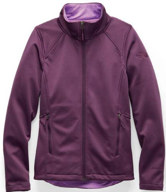
The North Face® Ladies Ridgewall Soft Shell Jacket NFOA3LGY | Ladies Sizes: S-2XL | 3 colors*