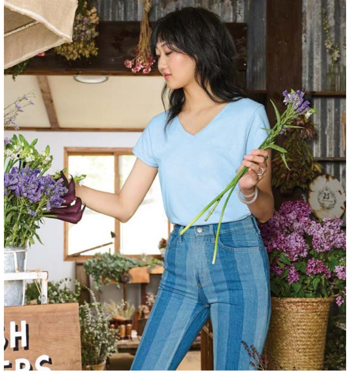
FREE District® Women's Re-Tee® V-Neck DT8001 | Women's Sizes: XS-4XL | 11 colors