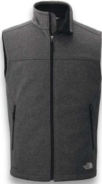
The North Face® Ridgewall Soft Shell Vest NFOA3LGZ Adult Sizes: S-3XL | 2 colors