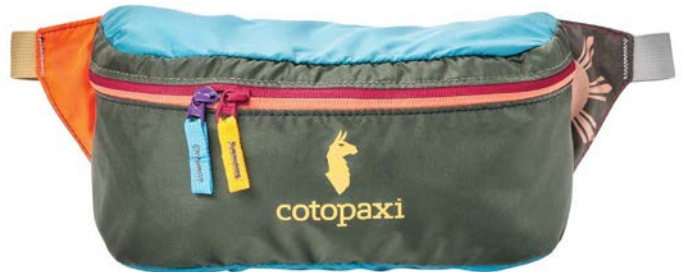
Cotopaxi Bataan Hip Pack COTOBFP | color: Surprise