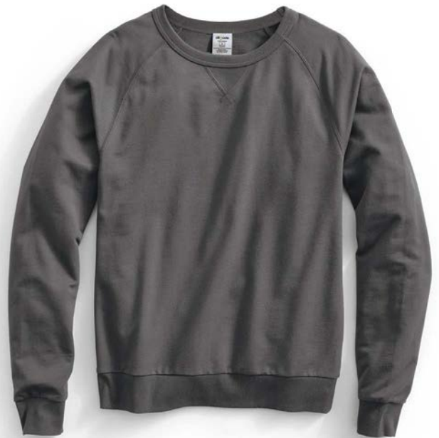
FREE Allmade® Unisex Organic French Terry Crewneck Sweatshirt AL4004 | Unisex Sizes: XS-4XL | 4 colors