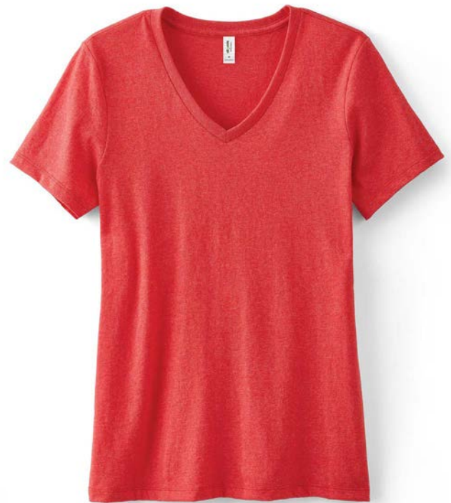
FREE Allmade® Women's Recycled Blend V-Neck Tee AL2303 | Women's Sizes: XS-2XL | 5 Colors