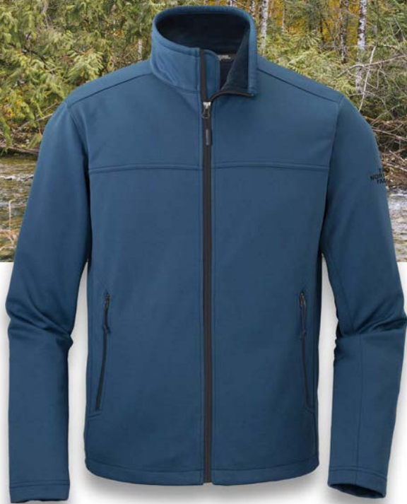
The North Face® Ridgewall Soft Shell Jacket NFOA3LGX | Adult Sizes: S-3XL | 4 colors*