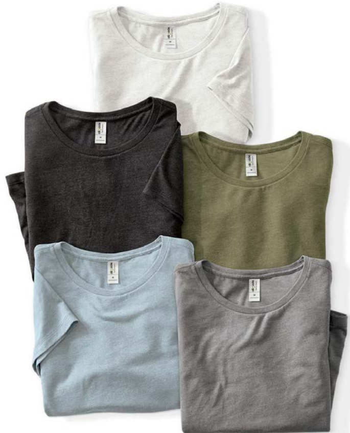
FREE Allmade® Women's Relaxed Tri-Blend Scoop Neck Tee AL2015 | Women's Sizes: XS-2XL | 5 colors