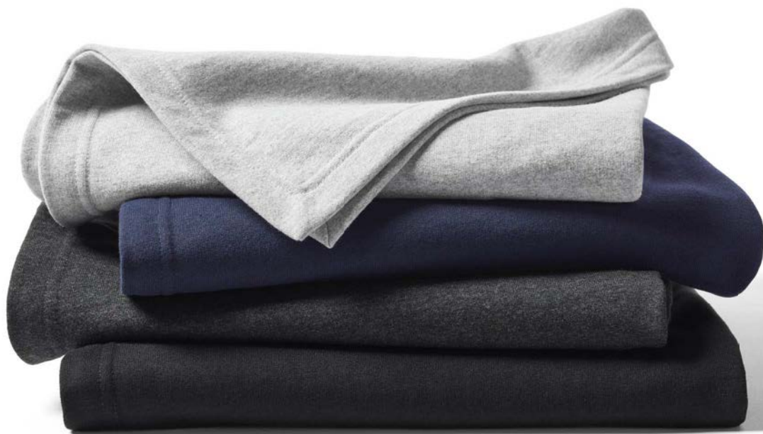
District® Re-Blanket™ DT81 | 4 colors