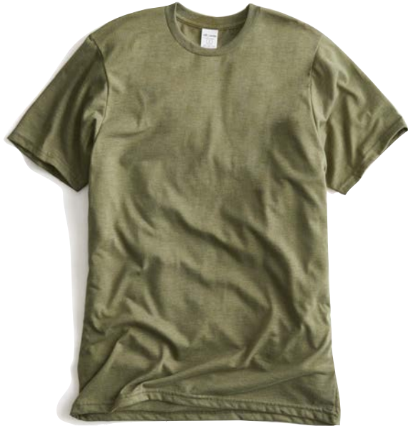
FREE Allmade® Unisex Tri-Blend Tee AL2004 Unisex Sizes: XS-4XL 22 colors

Feel your impact in these crazy-soft sustainable tees.