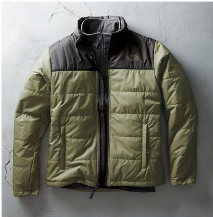
The North Face® Chest Logo Everyday Insulated Jacket NF0A7V6J | Adult Sizes: S-3XL | 3 colors