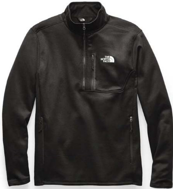
The North Face® Skyline 1/2-Zip Fleece NF0A7V63 | Adult Sizes: S-3XL | 3 colors