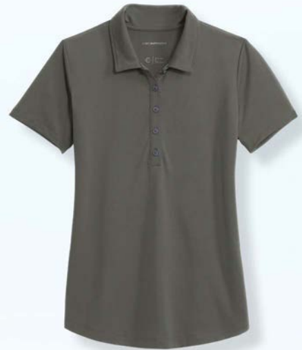
FREE Port Authority® Ladies C-FREE® Snag-Proof Polo LK864 | Ladies Sizes: XS-4XL | 6 colors