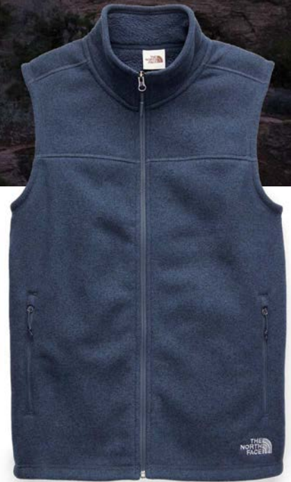
The North Face® Sweater Fleece Vest NFOA47FA Adult Sizes: S-3XL 3 colors