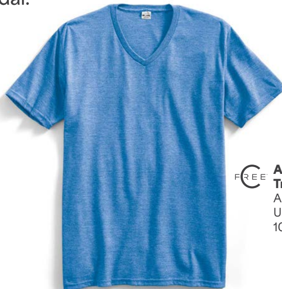
FREE Allmade® Unisex Tri-Blend V-Neck Tee AL2014 Unisex Sizes: XS-4XL 10 colors