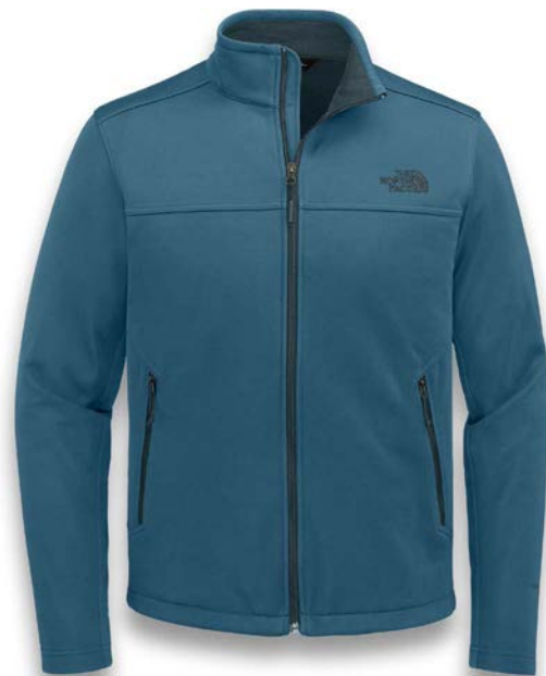
new The North Face® Chest Logo Ridgewall Soft Shell Jacket NFOA88D5 | Adult Sizes: S-3XL | 4 colors