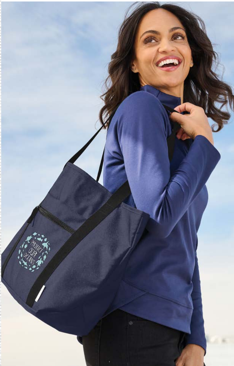
FREE Port Authority® C-FREE® Recycled Tote BG470 | 3 colors

Lighten your load and lower your footprint.