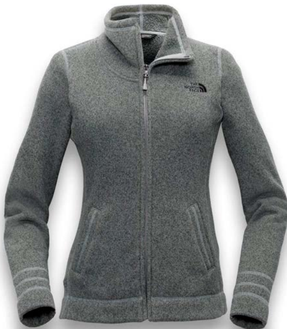
The North Face® Ladies Sweater Fleece Jacket NFOA3LH8 | Ladies Sizes: S-2XL | 2 colors