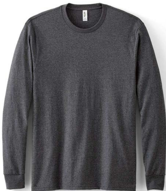
FREE Allmade® Unisex Long Sleeve Recycled Blend Tee AL6204 | Unisex Sizes: XS-4XL | 4 colors