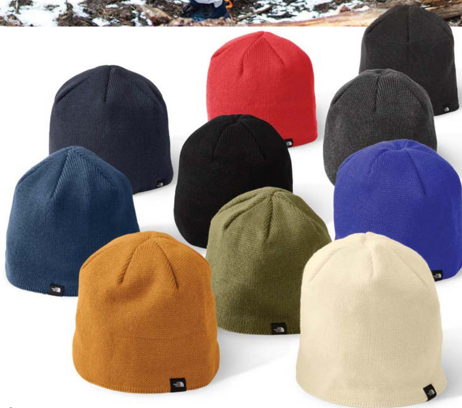
The North Face® Mountain Beanie NFOA4VUB | 10 colors