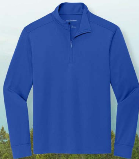
FREE Port Authority® C-FREE® Snag-Proof 1/4-Zip K865 | Adult Sizes: XS-4XL | 4 colors