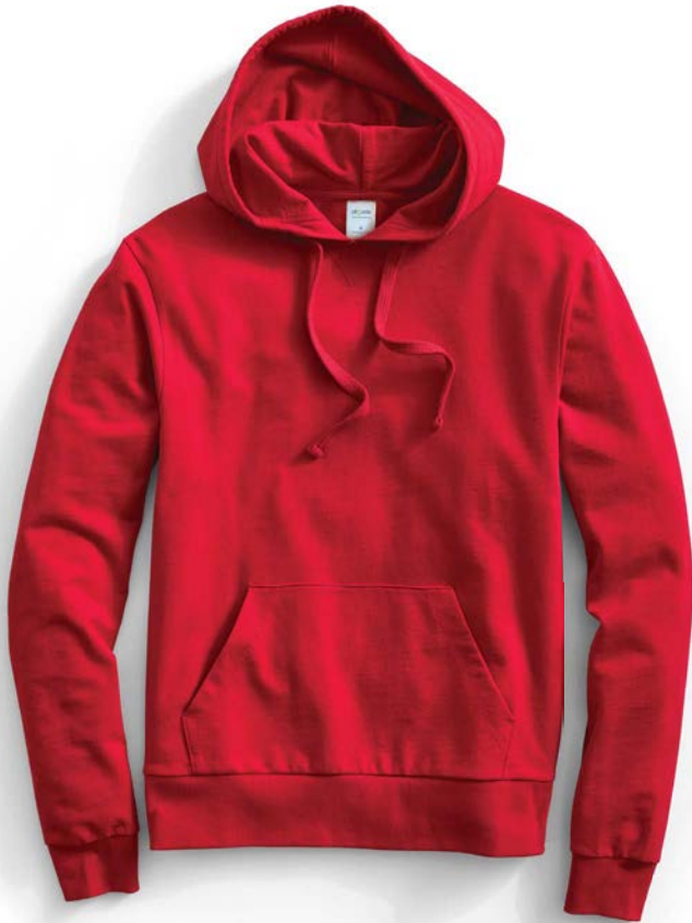
FREE Allmade® Unisex Organic French Terry Pullover Hoodie AL4000 Unisex Sizes: XS-4XL 6 colors

French terry styles and cotton tees are made from 100% organic cotton fabric.