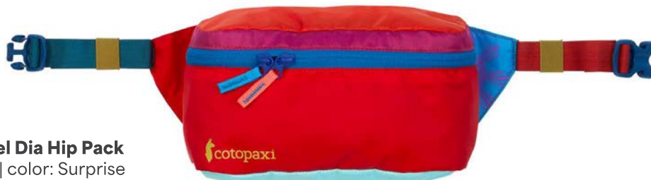
Cotopaxi Del Dia Hip Pack COTODDFP | color: Surprise