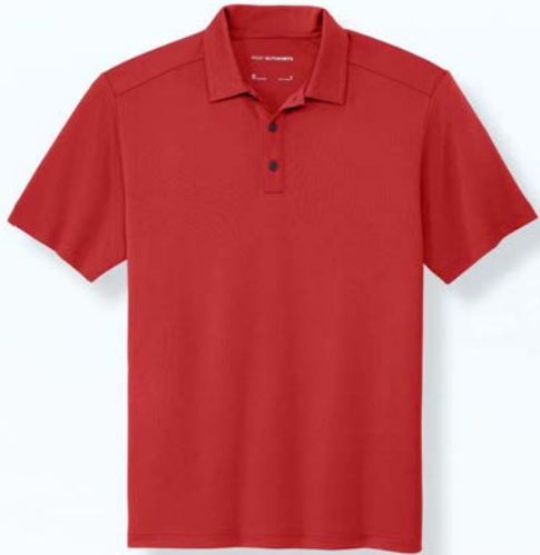
FREE Port Authority® C-FREE® Snag-Proof Polo K864 | Adult Sizes: XS-4XL | 6 colors