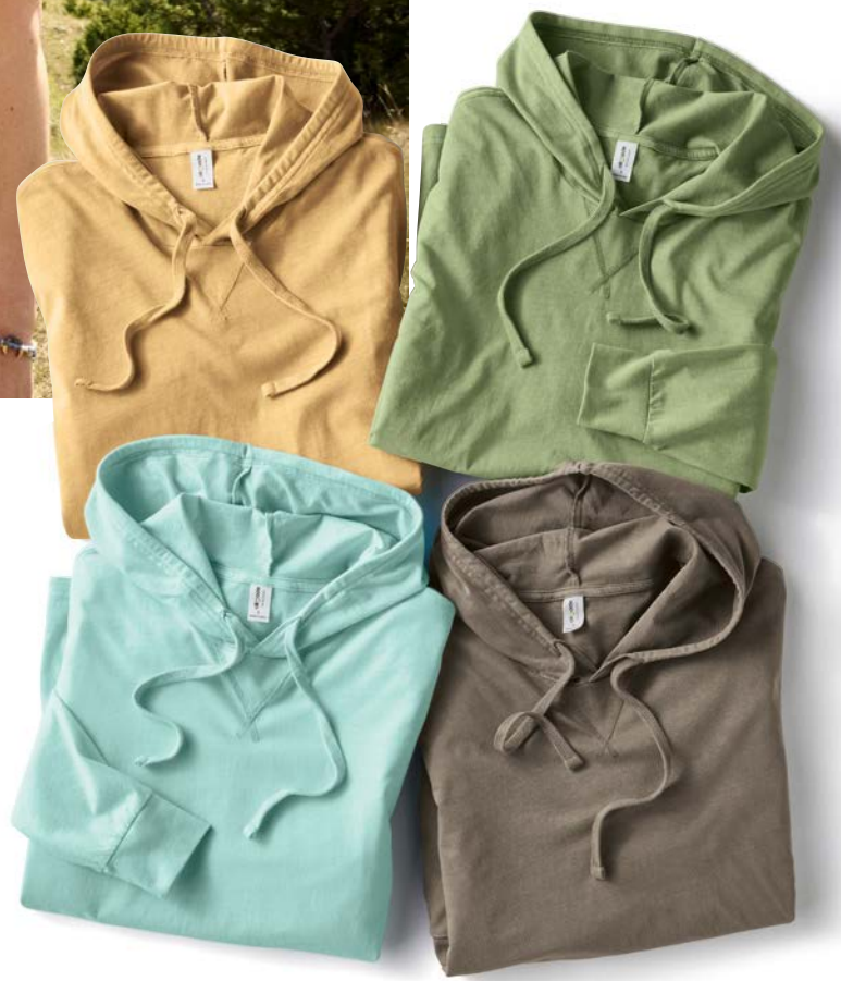
Allmade® Unisex Mineral Dye Organic Cotton Hoodie Tee AL6305 | Unisex Sizes: XS-4XL | 4 colors