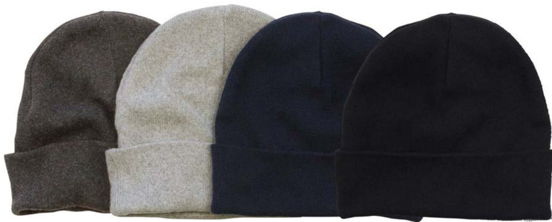
District® Re-Beanie™ DT815 | One Size Fits Most | 4 colors

Made from the Re-Fleece™ recycled materials you know and love.