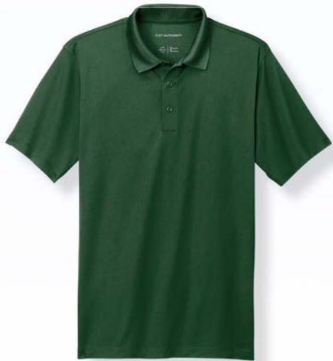
FREE Port Authority® C-FREE® Performance Polo K863 | Adult Sizes: XS-4XL | 7 colors