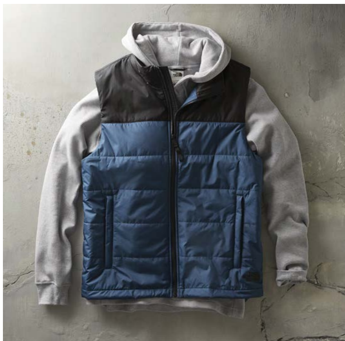
The North Face® Everyday Insulated Vest NF0A529A | Adult Sizes: S-3XL | 3 colors