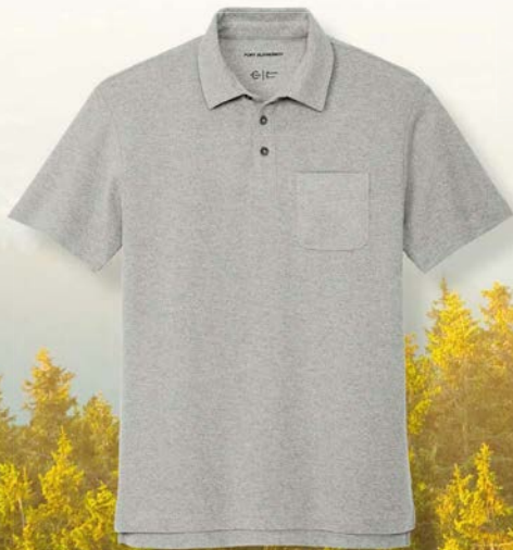
FREE Port Authority® C-FREE® Cotton Blend Pique Pocket Polo K868 | Adult Sizes: XS-4XL | 7 colors