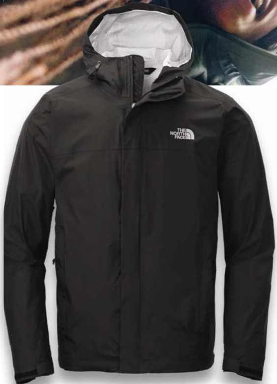
The North Face® DryVent™ Rain Jacket NFOA3LH4 | Adult Sizes: S-3XL | 3 colors