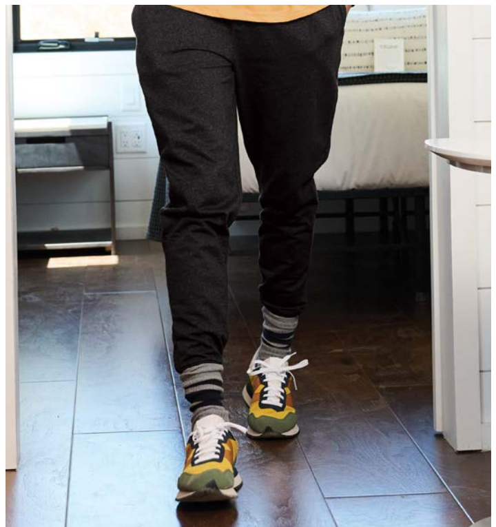
District® Re-Fleece™ Jogger DT8107 | Adult Sizes: XS-4XL | 2 colors