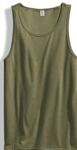
FREE Allmade® Unisex Tri-Blend Tank AL2019 Unisex Sizes: XS-4XL 6 colors