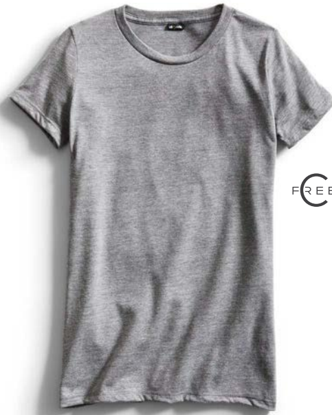
FREE Allmade® Women's Tri-Blend Tee AL2008 Women's Sizes: XS-2XL 12 colors