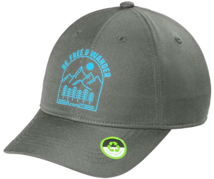
Port Authority® Eco Cap C954 | 4 colors