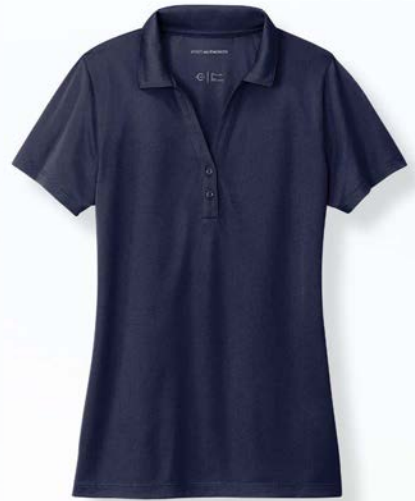
FREE Port Authority® Ladies C-FREE® Performance Polo LK863 | Ladies Sizes: XS-4XL | 6 colors