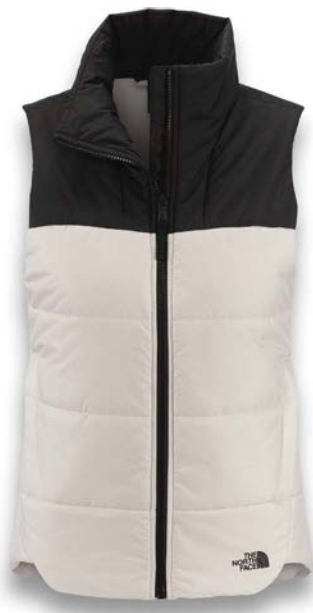
The North Face® Ladies Everyday Insulated Vest NF0A529Q | Ladies Sizes: S-2XL | 2 colors