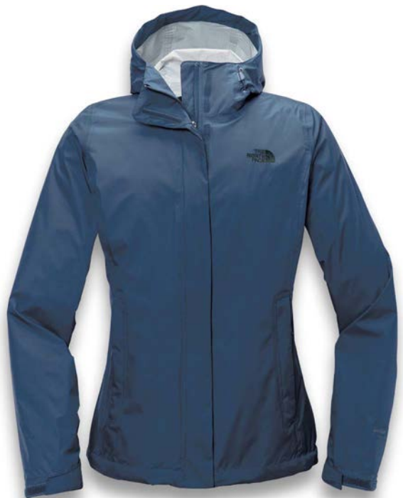
The North Face® Ladies DryVent™ Rain Jacket NFOA3LH5 | Ladies Sizes: S-2XL | 3 colors