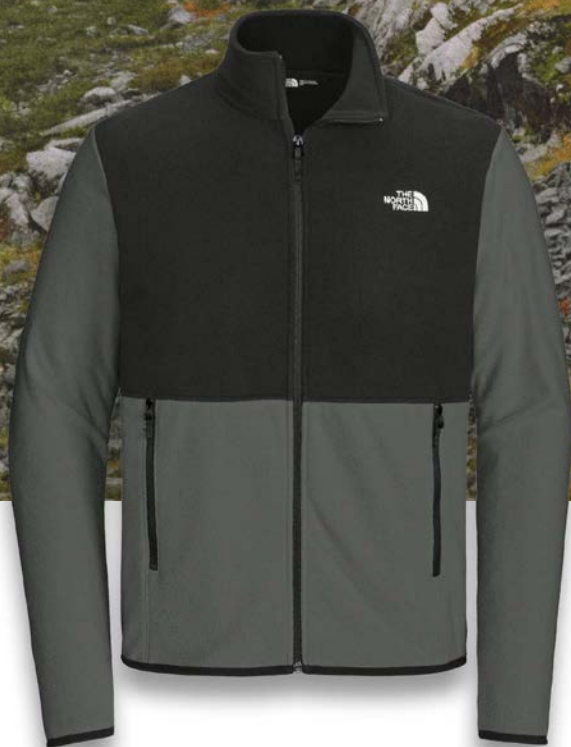
new The North Face® Glacier Full-Zip Fleece Jacket NF0A7V4J | Adult Sizes: S-3XL | 5 colors