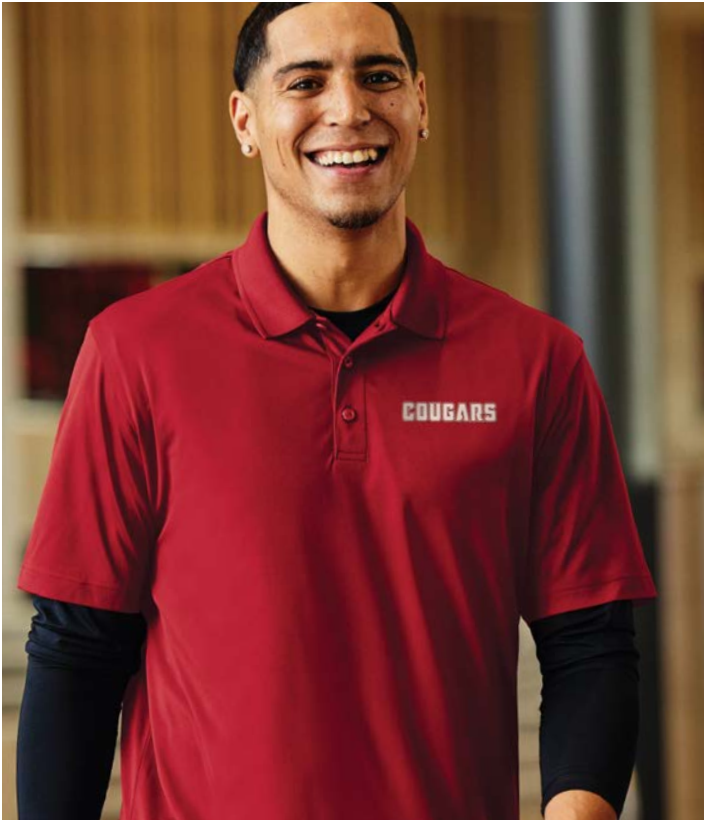
FREE Sport-Tek® PosiCharge® Re-Compete Polo ST725 | Adult Sizes: XS-4XL | 9 colors