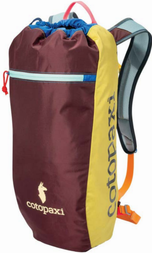
Cotopaxi Luzon 18L Backpack COTOL18L | color: Surprise

Made from a collection of fabric remnants in unique surprise color combinations.