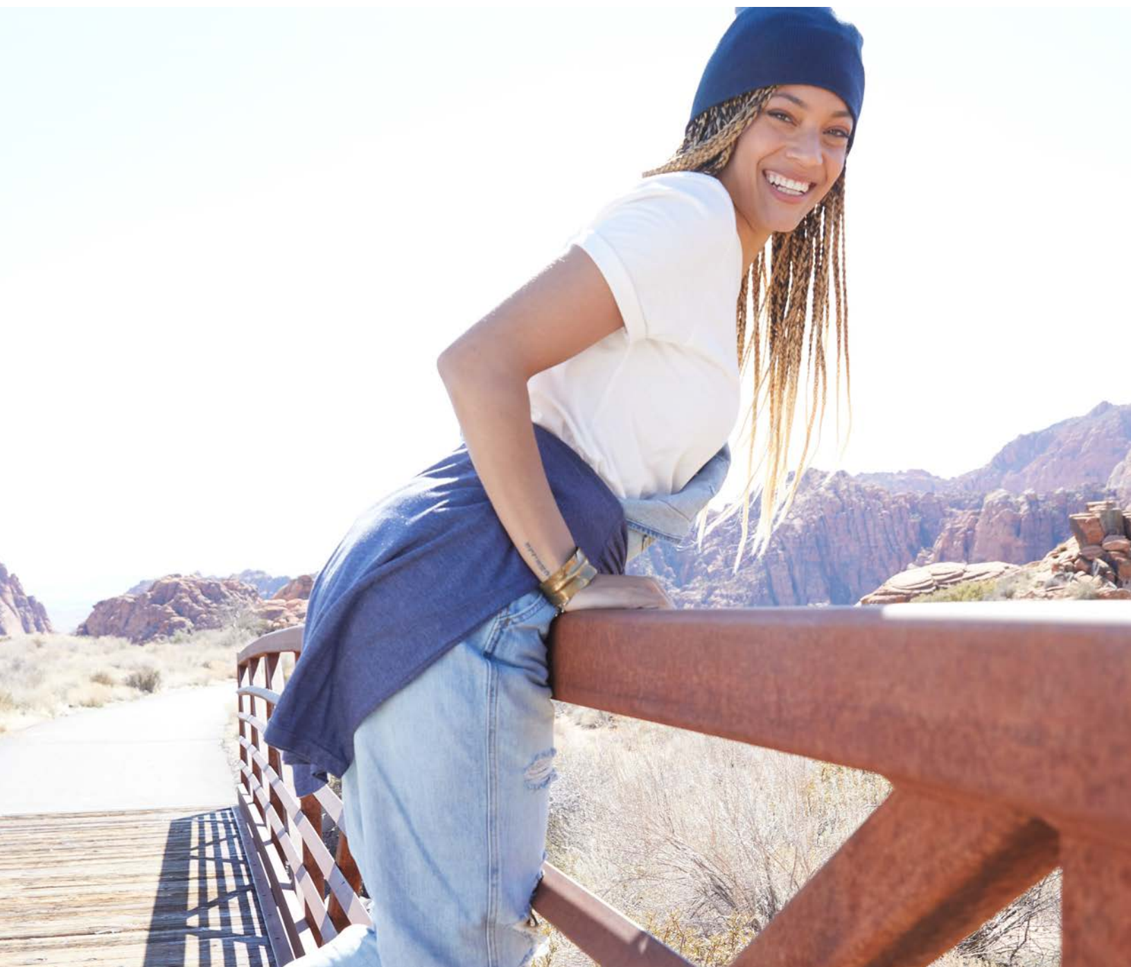
FREE Allmade® Unisex Organic Cotton Tee AL2100 | Unisex Sizes: XS-4XL | 11 colors