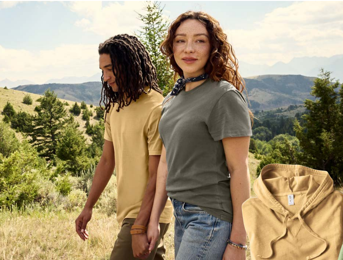
Allmade® Unisex Mineral Dye Organic Cotton Tee AL2400 | Unisex Sizes: XS-4XL | 4 colors