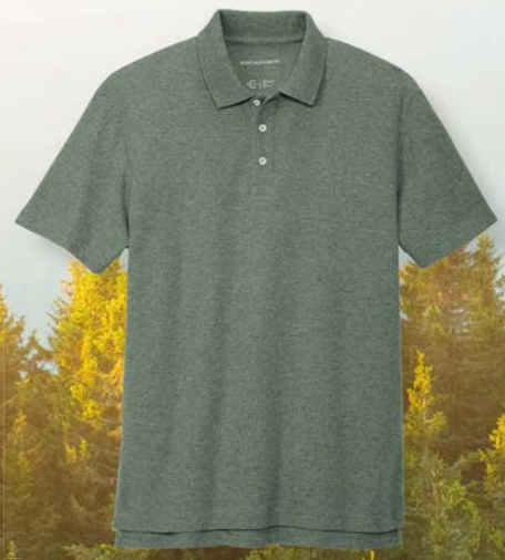
FREE Port Authority® C-FREE® Cotton Blend Pique Polo K867 | Adult Sizes: XS-4XL | 7 colors