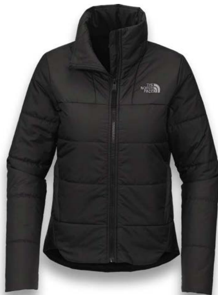
The North Face® Ladies Chest Logo Everyday Insulated Jacket NF0A7V6K | Ladies Sizes: S-2XL | 3 colors