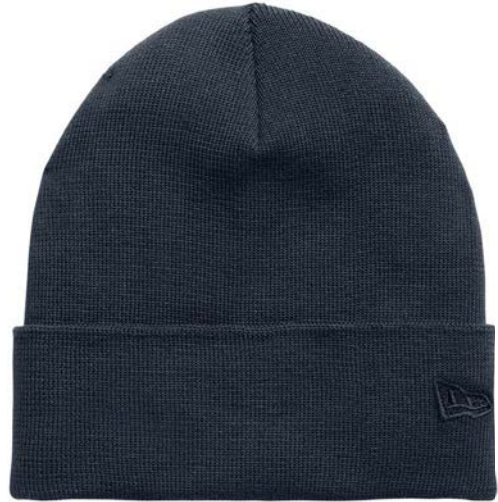
New Era® Recycled Cuff Beanie NE907 | One Size Fits Most | 3 colors