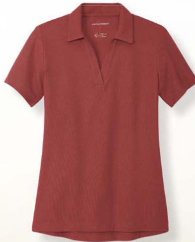
FREE Port Authority® Ladies C-FREE® Cotton Blend Pique Polo LK867 | Ladies Sizes: XS-4XL 7 colors