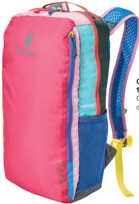
Cotopaxi Batac 16L Backpack COTOBTP color: Surprise